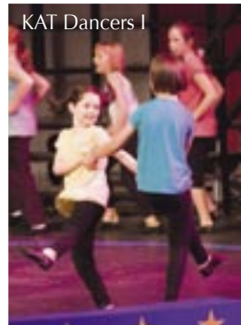
KAT Dancers I