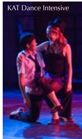
KAT Dance Intensive