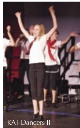
KAT Dancers II